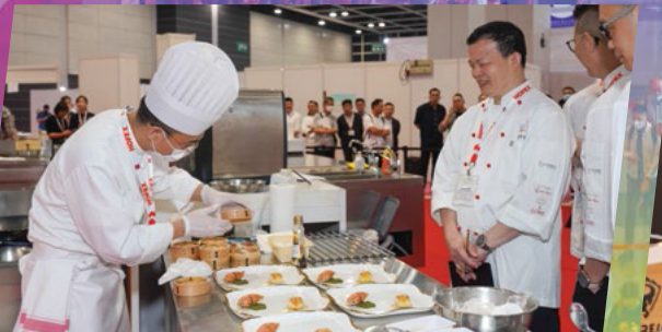
Hong Kong International Culinary Classic

Strike up lucrative relationships with like-minded industry peers, present your unique perspectives and get tangible takeaways through our series of competitions, live demonstrations, masterclasses, seminars and more!