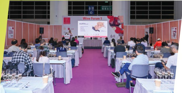
ProWine Hong Kong Wine Forum